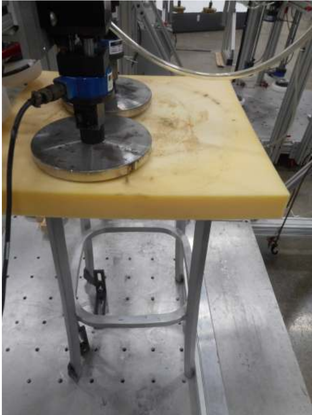
Load Ease Test