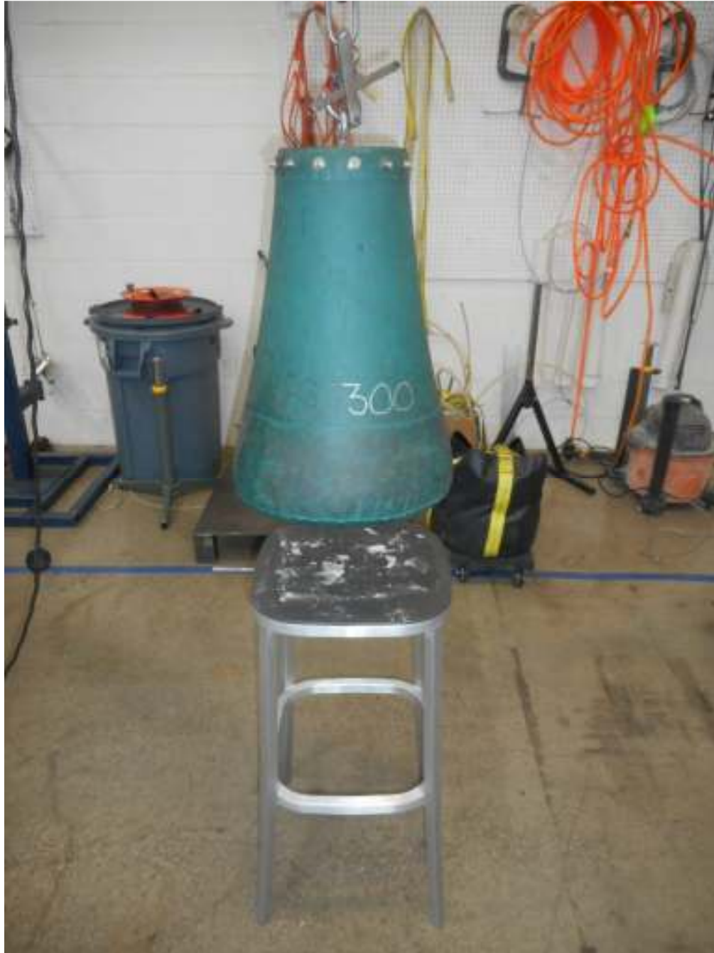
Drop Test – Dynamic