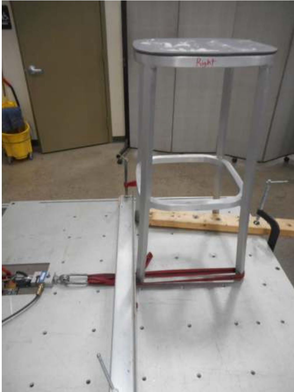
Leg Strength Test – Front Load