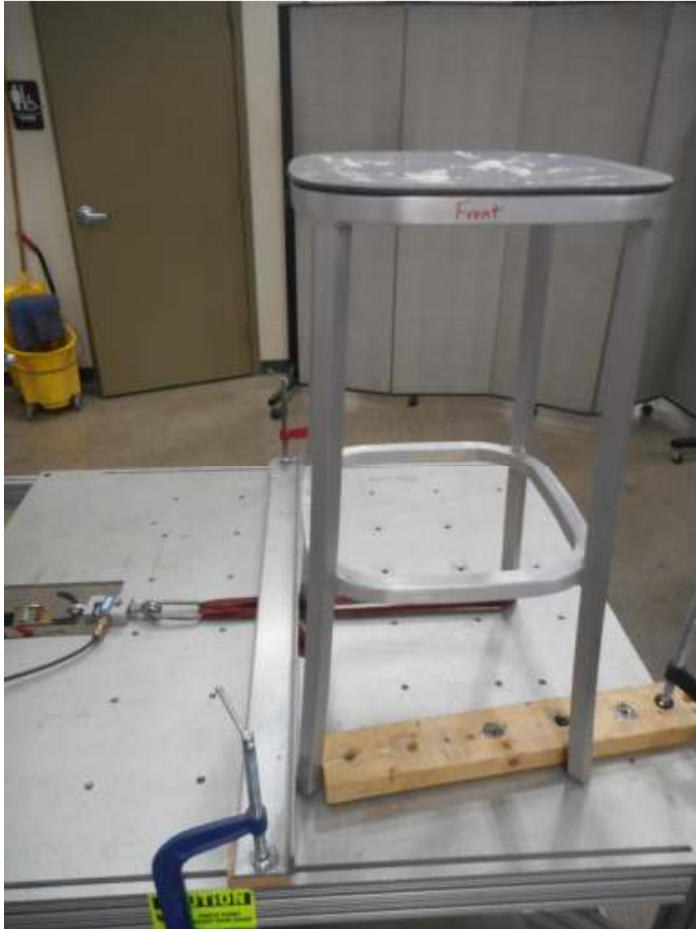
Leg Strength Test – Side Load