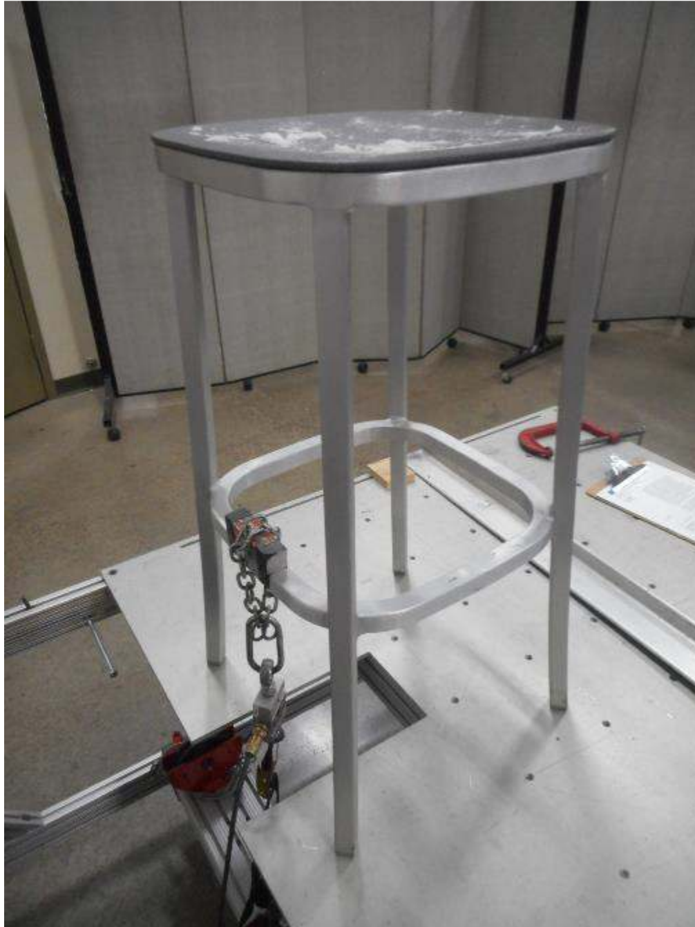
Footrest Durability Test – Vertical – Cyclic