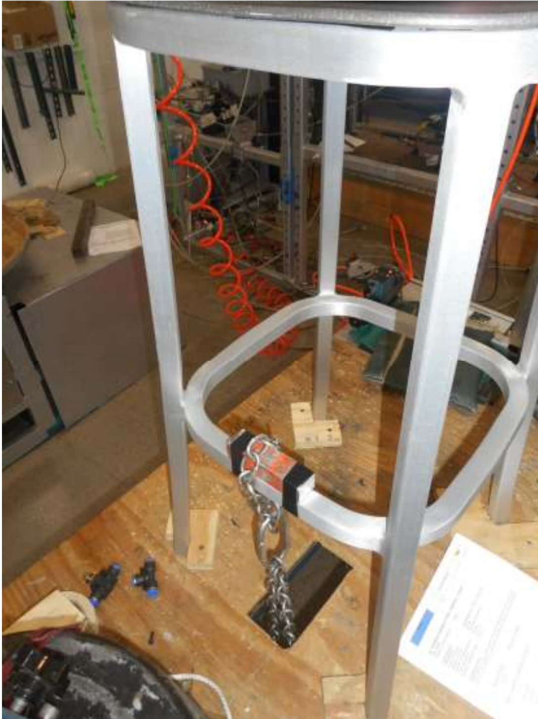
Footrest Static Load Test -- Vertical