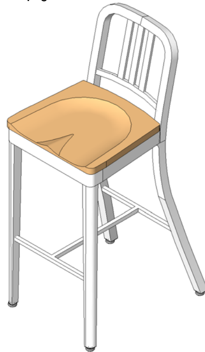
④ 3D View