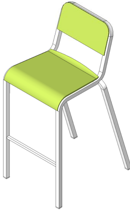
④ 3D View