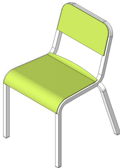
④ 3D View